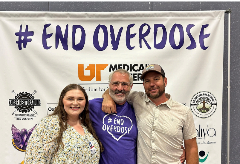
KCGCD staff attended International Overdose Awareness Day in August.