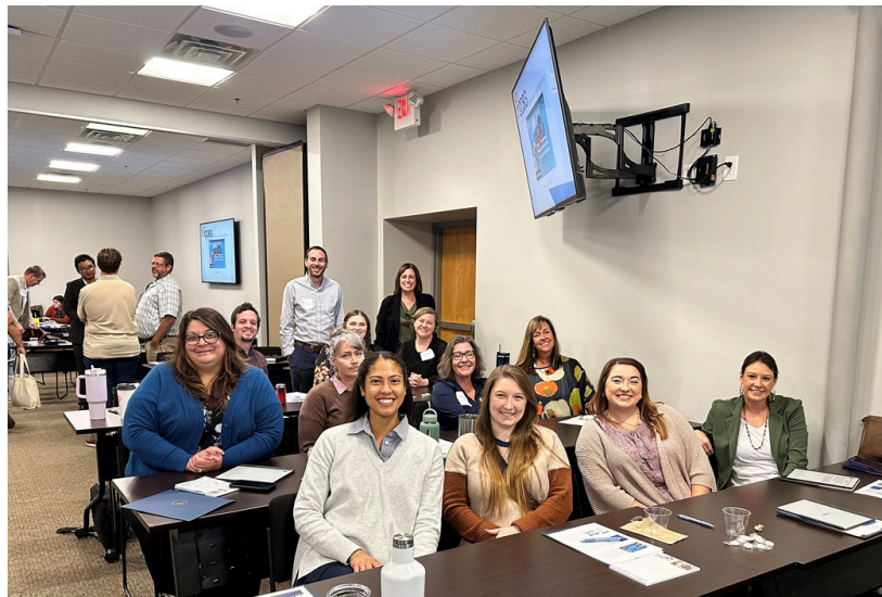
The Community Service, Community Development, and Administrative Divisions attended HUDs Tennessee All Grantee Meeting in September.