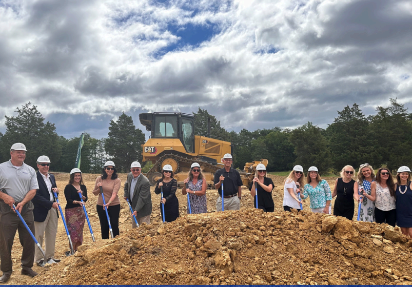
McNabb Center broke ground on new recovery and transitional housing for women in July.