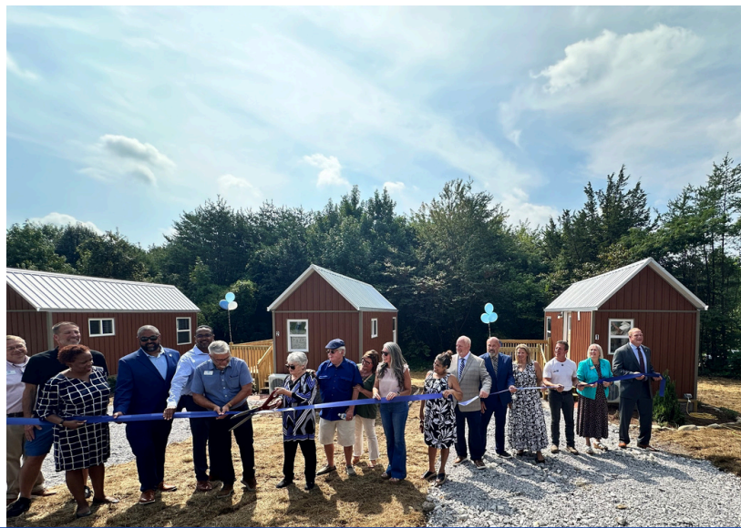
Angelic Ministries held a ribbon cutting for their new tiny home recovery housing units at Zion's Ranch.