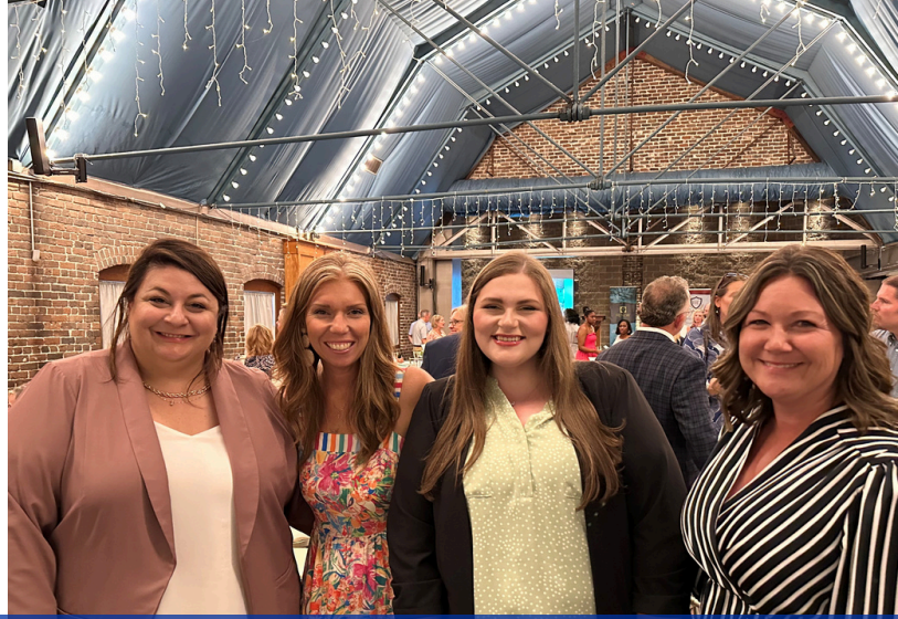
KCGCD attended Renew Clinic's annual Shining Light in the Darkness Dinner in July.